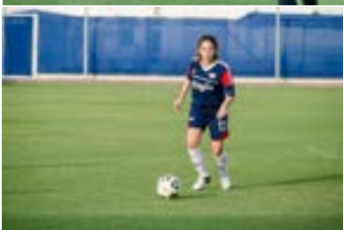
JV Girls Soccer game vs. Chouiefat School on Wednesday