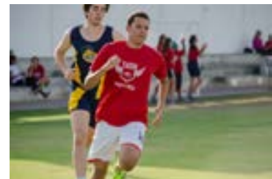
Track & Field vs. the American British Academy (ABA) @ TAISM