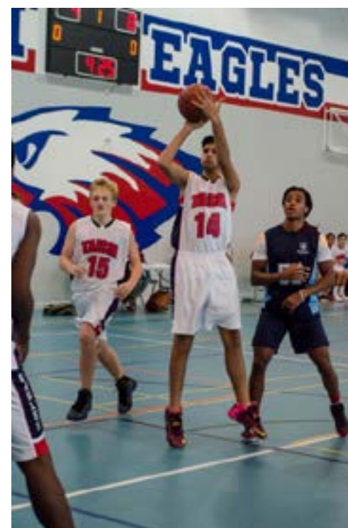
Varsity Boys Basketball game vs. BSM @ TAISM