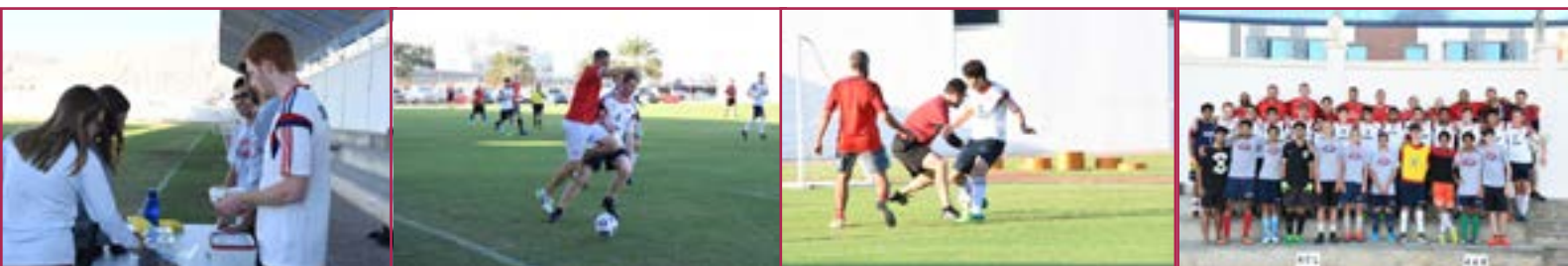
Sundays JV/Varsity Soccer game vs. Staff & Bake Sale to raise funds for Men's Health (Movember). Face Painting done by the HS Community Service students.