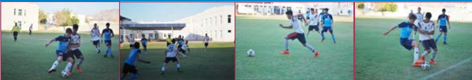
Last Wednesdays Varsity Boys Soccer game vs. BSM