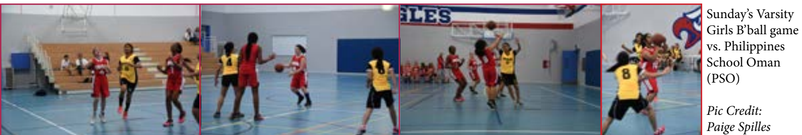
Sunday's Varsity Girls B'ball game vs. Philippines School Oman (PSO)