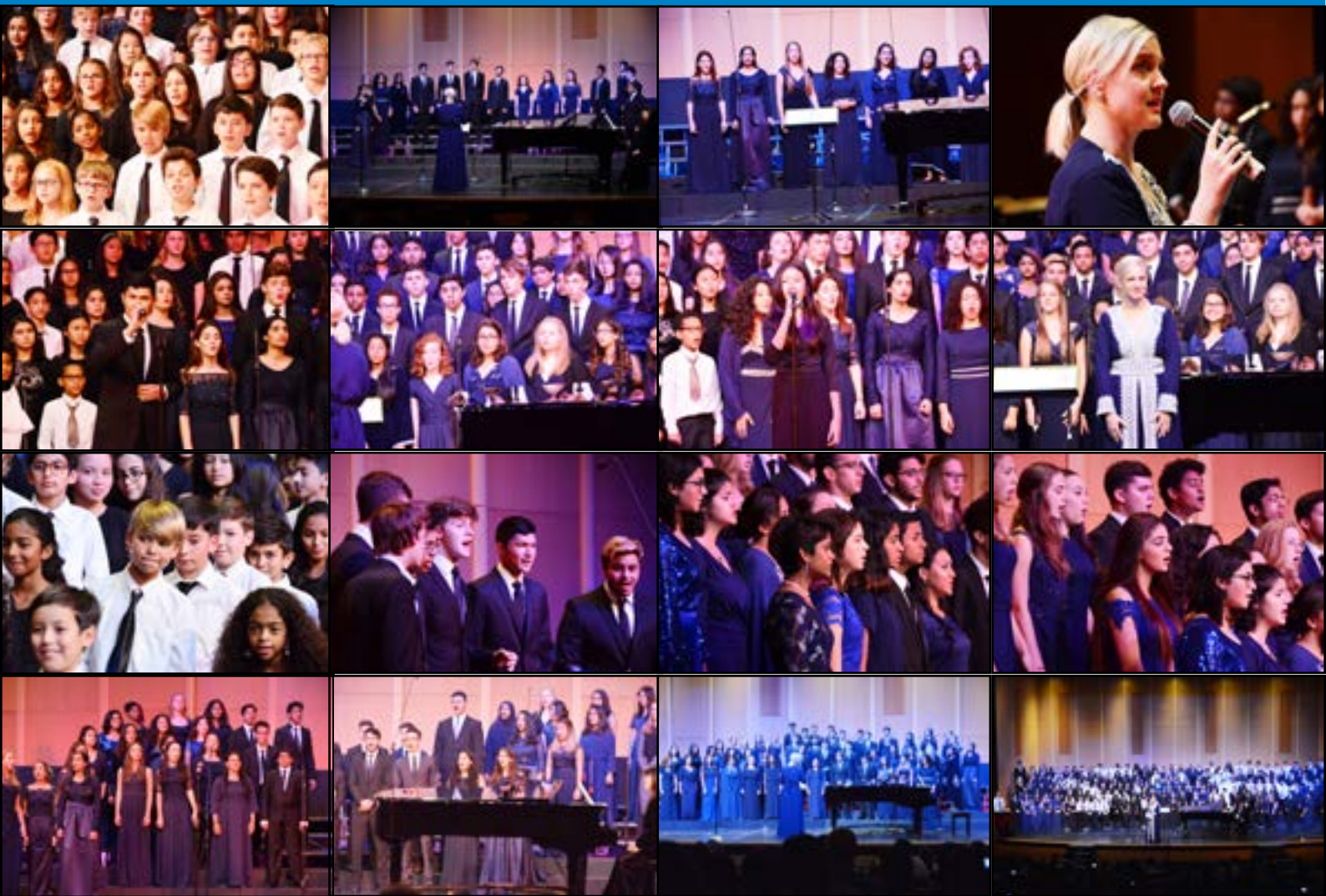
Scenes from Wednesday nights MS/HS Choir Concert at the Bosch Center.